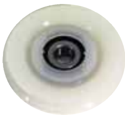
9701588 40158 Sheave 2 3/8" dia. Nylon Relating Cable