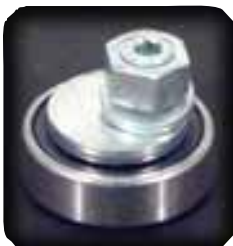
9861191 Upthrust Roller