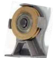
9811102 Sheave & Bracket Assembly for Vertical Gate