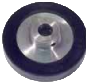
9715447, 894aa1 Roller (3" O.D.) for tachometer with 1/2" Shaft