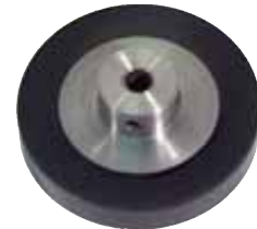
9766169 Roller (3" O.D.) for Tachometer with 5/16" shaft