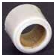
9875426 Tire for Upthrust Roller