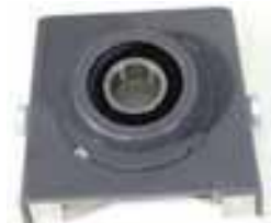
9838697 Slide Assy