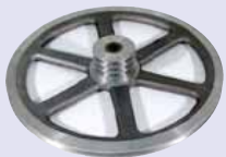
9876686 Jack Shaft Sheave, 12"; replaces old 13" sheave