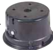
9741770 DMC Door Operator Motor Optical Sensor