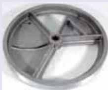
9842214 Drive Sheave, 14"