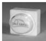
D455WXFH/CC Fire Hat, clear cap, Call Cancel