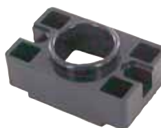
D455H1 Black lexan halo