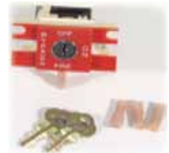
9746160 Keyswitch, Fire Bypass