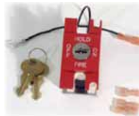
9746031 Keyswitch, Car Fire Service