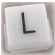
D469-L P.I. lens with L