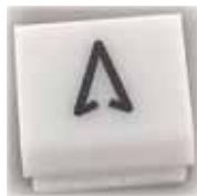
D470-AU P.I. lens with UP arrow