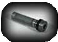
9824467 Strainer, Main Body, 1-1, 1-2, 5/16" Diam, SS