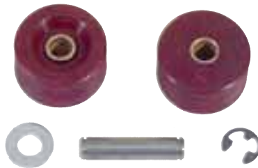
9721058, 120157 Roller Kit, IVO Jack, with rollers & hardware