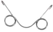
Spring, Needle Valve, P-Series 9730230