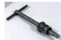
9811059 Valve, T-Handle Manual Lowering, T-2