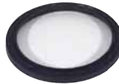
112733 Spider Seal