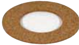
9840503 Worm Shaft Seal