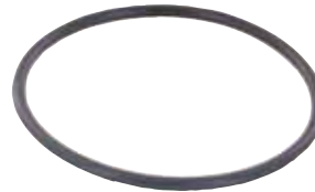
9709848 Gasket 2 78 x 3 116