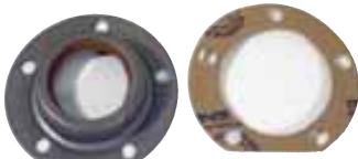
9840503 Worm Shaft Seal