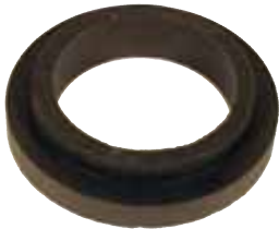
9712665 2" Sound-Insulation Gasket