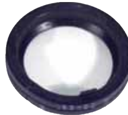
9825514 Worm Seal