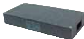
GL-902-D4 Interlock Box Type MOCP