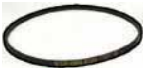
GL-870-A V-Belt 44"