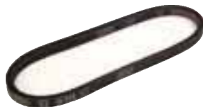
GL-870-B Drive Belt 24"