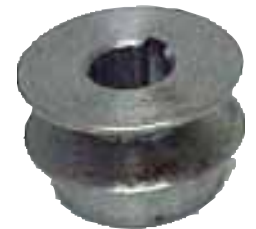
GL-915-H9 Motor Pulley