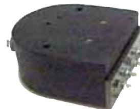
GL-1098-E Reverse Phase Relay