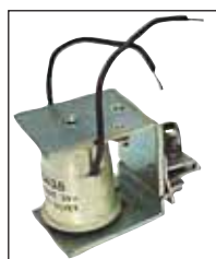
GL-100-A6 Armature & Frame Assy. w/Coil (G.A.L. # LC-28#1)