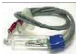
GL-1098-C GAL Switch