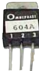
GL-1600-C GAL Limit Control Board