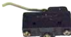
GL-1132-A GAL Micro-Switch