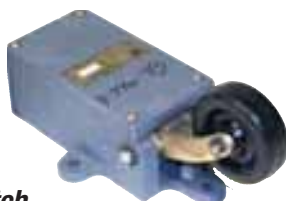
GL-925-H Limit Switch