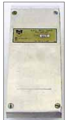
GL-922-E Magnetic Leveling