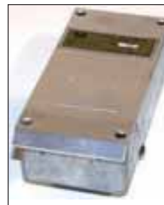
GL-922-A LU Leveling Switch