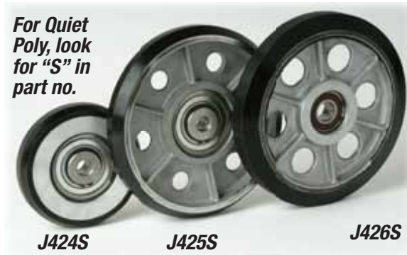
For Quiet Poly, look for "S" in part no.