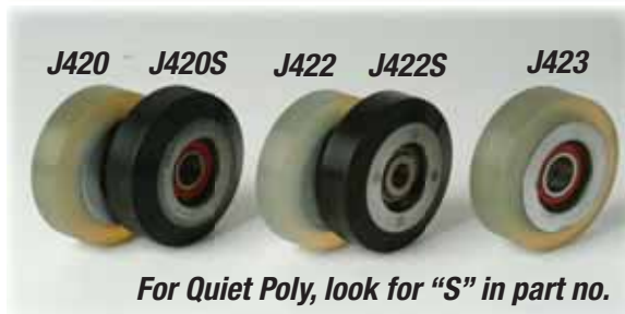
For Quiet Poly, look for "S" in part no.