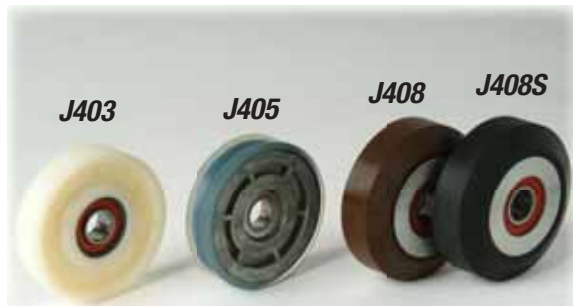
For Quiet Poly, look for "S" in part no.

Door hanger rollers feature LFx 70 ™ Low Friction poly.