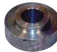
3-19327-02 Roller Hub 1.75"