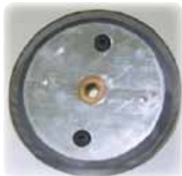
3-40052-31 Pulse Wheel & Collar