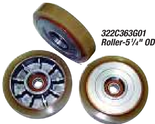
322C363G01 Roller-5 1 / 4 " OD