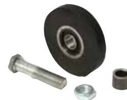
3-19373-03 Limit Switch Roller Assembly