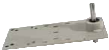
3-40132-81 Shaft & bracket