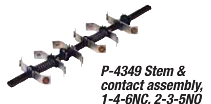
P-4349 Stem & contact assembly, 1-4-6NC, 2-3-5NO