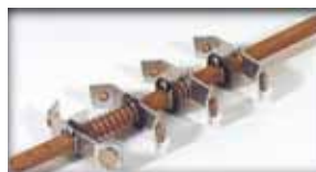
P-4354 Stem & contact assembly, 1NC, 2-3-4NO