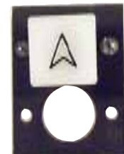
P-6440-AR Pushbutton, arrow