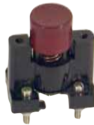
P-2050 Red pushbutton