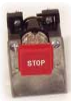
P-22572-072 STOP switch