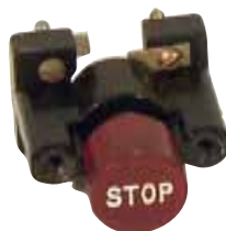
P-2050-H72 STOP switch, horizontal