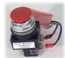
65974-001 STOP switch