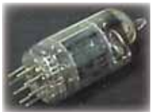
425P1 Otis Touch Tube 2.18" L x .68 O.D.