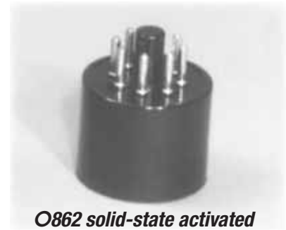
O862 solid-state activated switch assembly