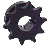
195GK2 Otis Sprocket .626 I.D. 10 teeth Used on 7300A,AA