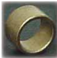
335E86 Otis Oil Lite Bushing