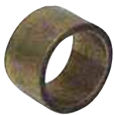
335E22 Otis Oil lite Bushing