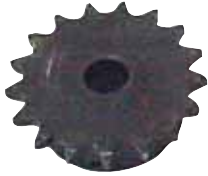
195AT2 Otis Sprocket