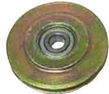
265BD2 Otis Sheave 2 5/8" diameter