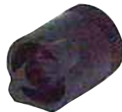
334C1 Otis Bushing