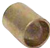
335E84 Otis Oil Lite Bushing