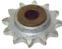
195CH2 Otis Sprocket 12 teeth 1.56" O.D. for 6850A, B, C