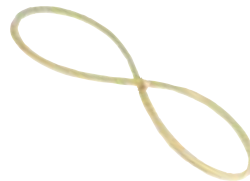
251BT3 Otis Sheave Rope