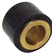
321CJ4 Otis Bushing