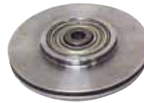
265BC2 Otis Sheave 5" diameter