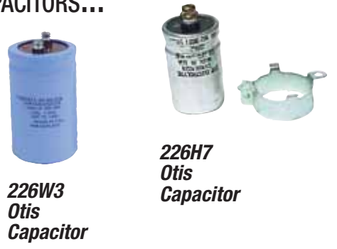
226W3 Otis Capacitor