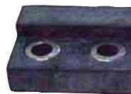
320AD2 Otis Bumper 1.625"W