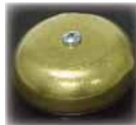
311B4 Otis Gong w/Coil