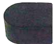
320CD1 Otis Bumper