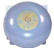
4356E1 Otis Emerg. Alarm Bell 12V