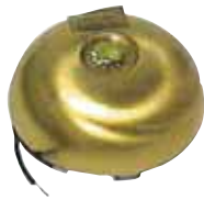
311B8 Otis Gong w/Coil