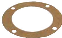
372DE1 Gasket for 6970A Door Operator