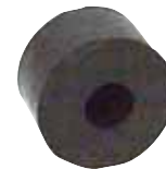
320AM1 Otis Bumper