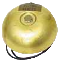
311B2 Otis Gong