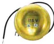
311B1 Otis Gong