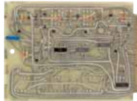
A8111B4 Traffic/group zone board