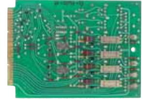
A8116A7 Hall call