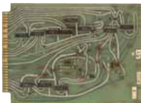
A8111D2 Car Function board