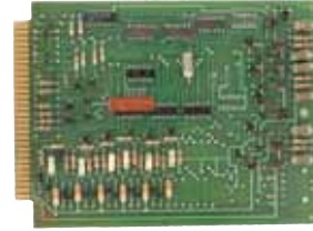
A8116B3 Hall call