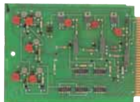
A8114G1 Car signal interface board