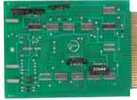
C8112B1 Car Variable #2 PCB for LRV3 Main Processor