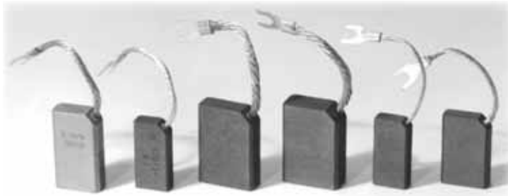
W75A6 W75A32 W75A65 W75A14 W75A40 W75A83