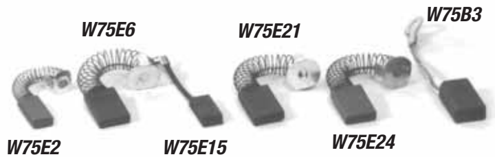
W75E2 W75E15 W75E21 W75E24 W75B3