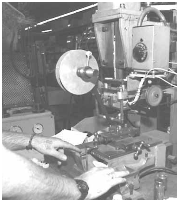
Adams hot stamping gives clean, crisp characters, and uniform appearance throughout each button series

Button series WC456W 3 Color/style WC456W Character 3