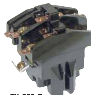
FN-960-T OEM no. 41NB30AFP