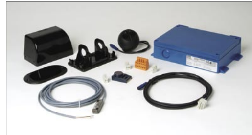
Complete with all mounting hardware necessary for either surface-mount or flush-mount installation on cab transom